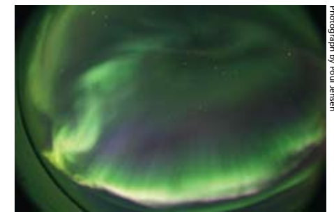
Figure 6. Intense aurora develops a purple border below the green curtains in this fish eye view of almost the entire sky above Fairbanks, Alaska. Note the Big Dipper near the zenith.