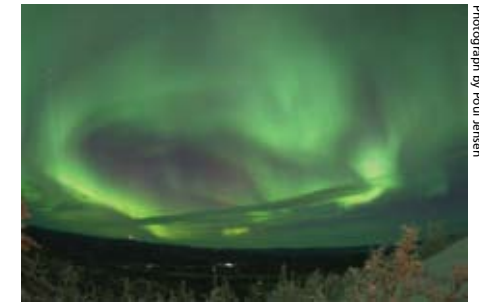
Figure 5. A large spiral that fills a large portion of the sky in this extreme wide-angle photo from Ester Dome near Fairbanks, Alaska.

In addition to looking at the color balance and brightness, we can measure the wavelength of individual emission lines in the aurora with very high accuracy. This allows us to determine the Doppler shift of emission lines. The Doppler effect for light emission causes a shortening of the wavelength of the emission if the emitting atom or molecule is moving toward the observer, and a lengthening of the wavelength if it is moving away. A shorter wavelength means a color closer to the blue end of the spectrum; longer wavelength means a shift to red. In aurora, these shifts are miniscule, but can be observed with high spectral resolution instruments, in particular Fabry-Perot interferometers (FPI). Because the red and green line emissions from atomic oxygen are so long lived, they are good candidates for FPI